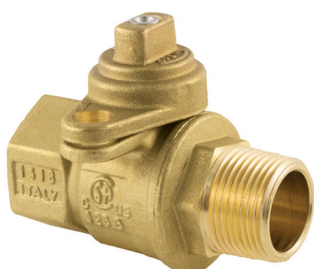
MIP x FIP 125-LWN