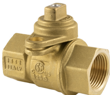
FIP x FIP