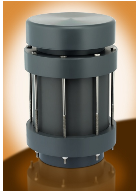
VBS 3" & 4" Dimensions – All Materials

Threaded connections are standard on all models. Socket ends, BSP threads, JIS and DIN connections are available on all sizes and materials. Inlet connection is shipped with standard dust cap. Cap is removable for applications where pipe connection is desired due to location, potential hazard, etc. The inlet connection is identical to the connection on the system side of the valve. If your application requires an unusual connection, custom material or configuration, please contact our Technical Team at 973-256-3000.